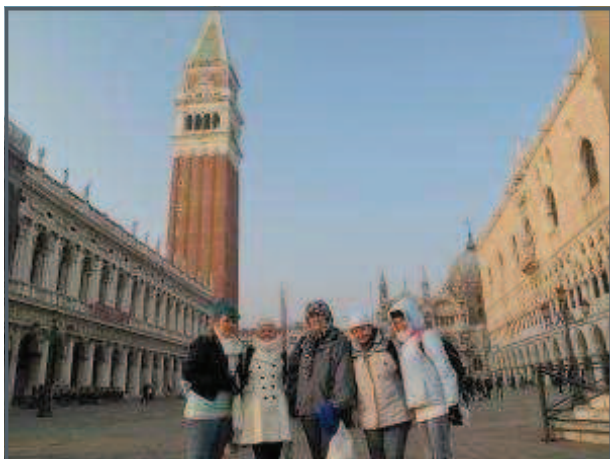
Italy St Marks Square